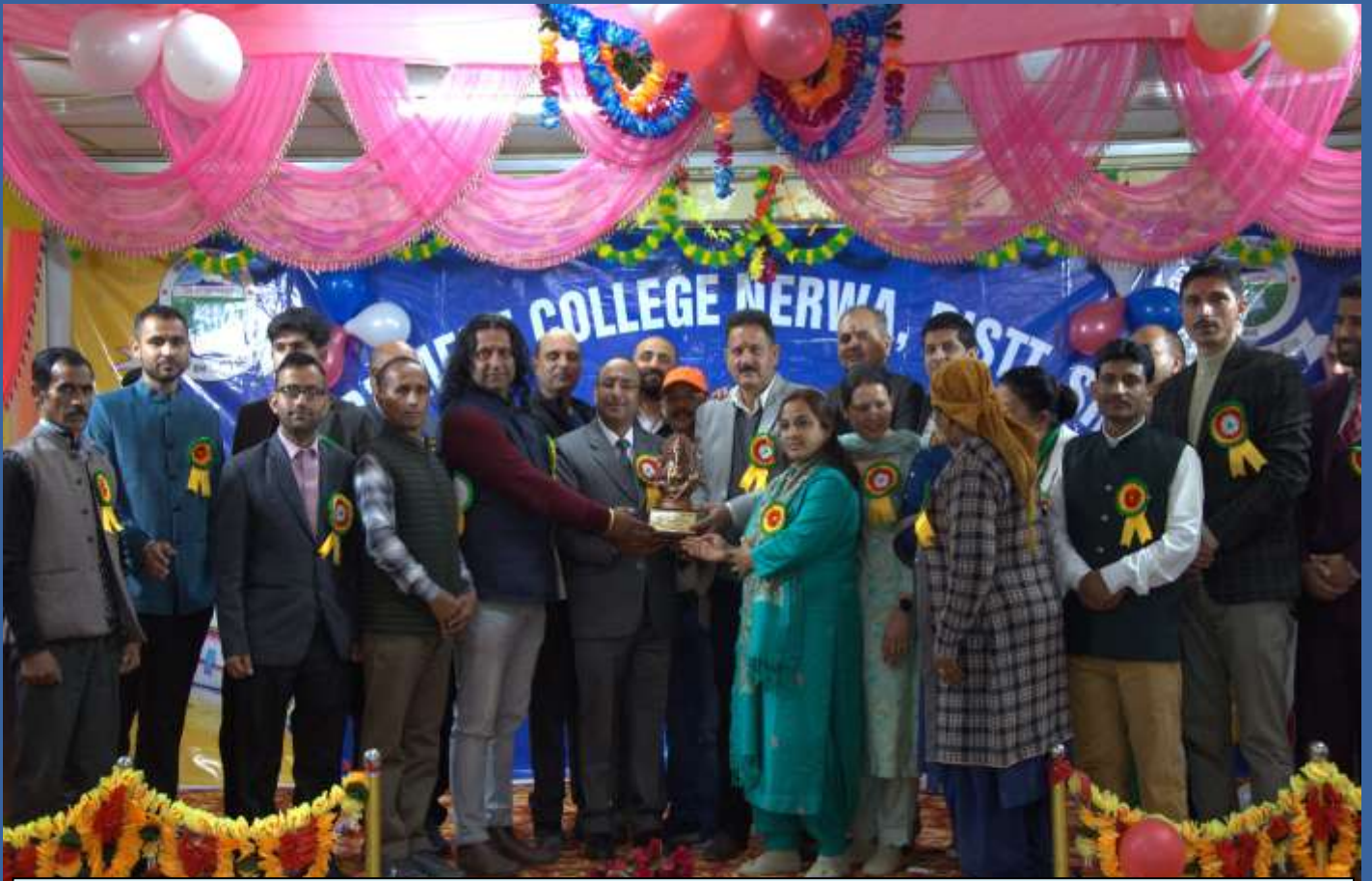
Honoring The Chief-Guest