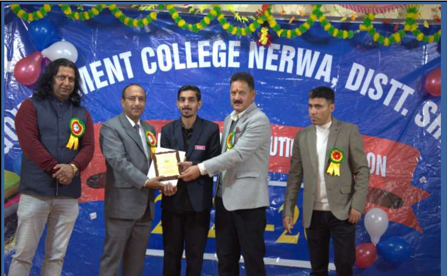
CSCA PRESIDENT (2025-26)