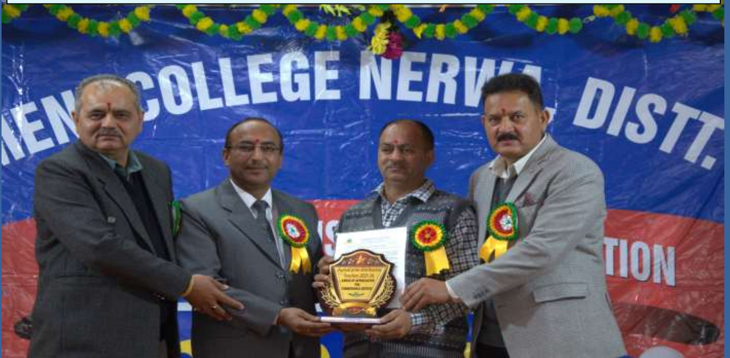
Awards Of Appreciation for Commendable Services